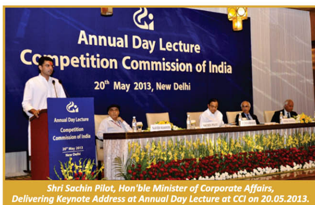
Shri Sachin Pilot, Hon'ble Minister of Corporate Affairs, Delivering Keynote Address at Annual Day Lecture at CCI on 20.05.2013.

Minister, delivering the Inaugural address, emphasized the need for redefining the role of the government as a regulator of competition and as a participant in the competitive process. Shri Sachin Pilot, Hon'ble Minister of State (Independent Charge) for Corporate Affairs, in his Key Note address suggested that competition is a major driver for productivity growth in the economy and international competitiveness. He exhorted the Commission to promote competition advocacy proactively, so as to persuade the Government to reduce entry barriers prescribed in policies; promote de-regulation and trade liberalization to promote competition in the market place.